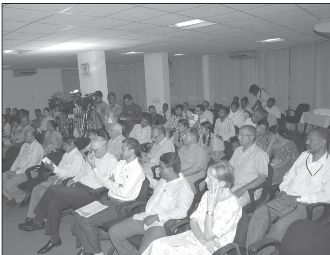
Audience at the function