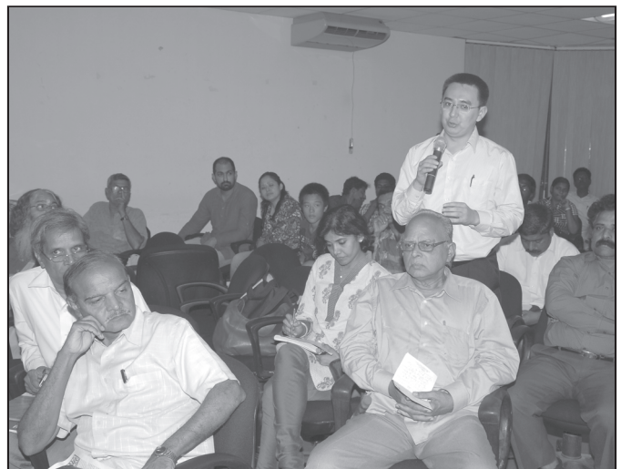
Audience at the function