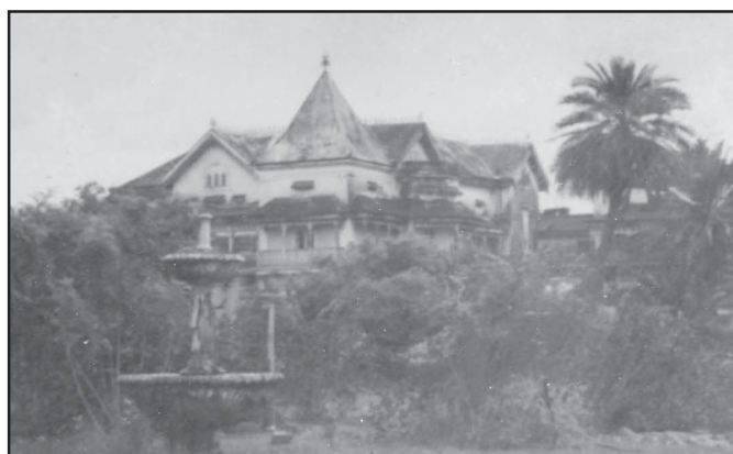
Vilayat Manzil (or) Deorhi Wali-Doula Begumpet (Present Country Club)

Since HMDA have not replied to Forum's letter dt 22.9.09, Appellate Authority under RTI Act in HMDA was approached on 17.11.09, to which also no reply has been received.