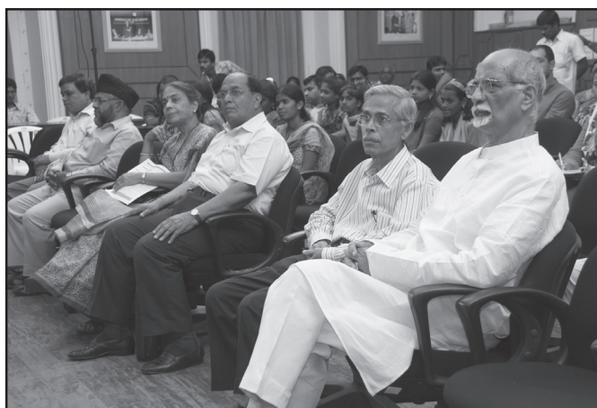
A section of audience